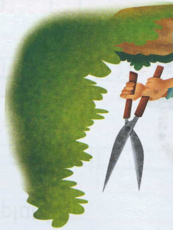
is a gardener.